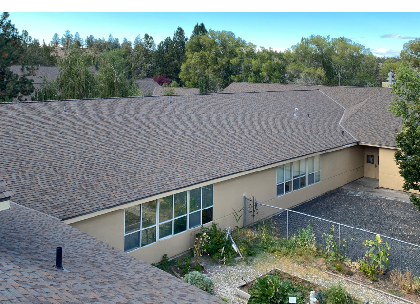
A new roof for Tumalo Community School