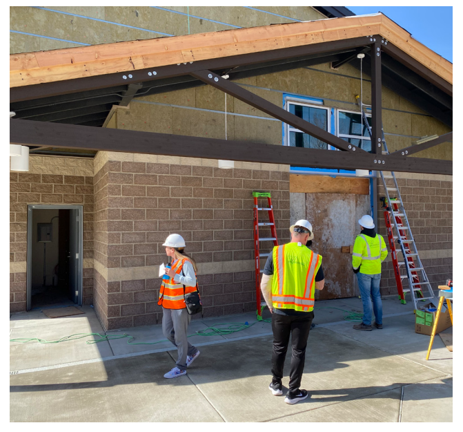
Tom McCall Elementary expands capacity with a new classroom wing